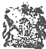
TOM ROPER Minister for Planning and Environment

Recommended to His Excellency the Governor in Council that the attached Notice of Recommendations in relation to the Land Conservation Council's Latrobe Valley Special Investigation be approved.